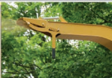
360° Swivel And Angle Control Chute