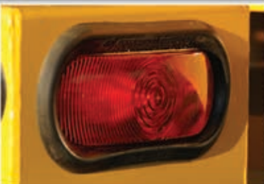
Brake and L/R Turn Signal Lights