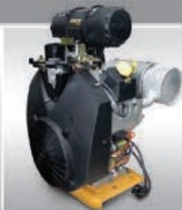
KOHLER 999 CC Kohler Engine