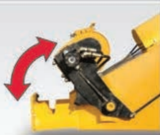
Lift assist for servicing using gas shocks.