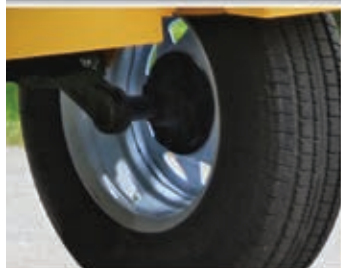
Torflex® Suspension Axle, Highway Tires