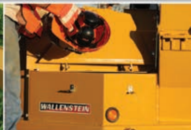
Built-in Storage Box