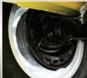
Electric brakes eliminate extra load on vehicle 6438P only