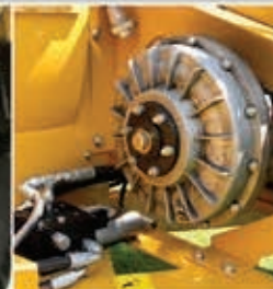
Auto engage fluid coupler is ideal for contractors where heavy duty work is required